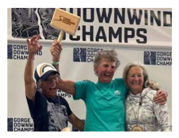
Priscilla Gets Second 60+ Womens, Congrats!