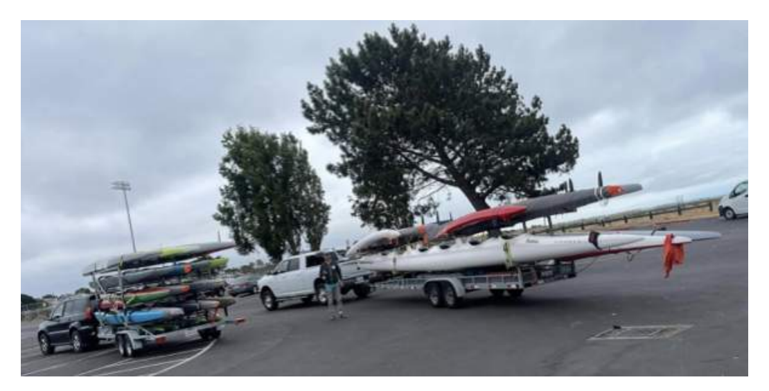
Heading out. New OC1 Trailer fully loaded!