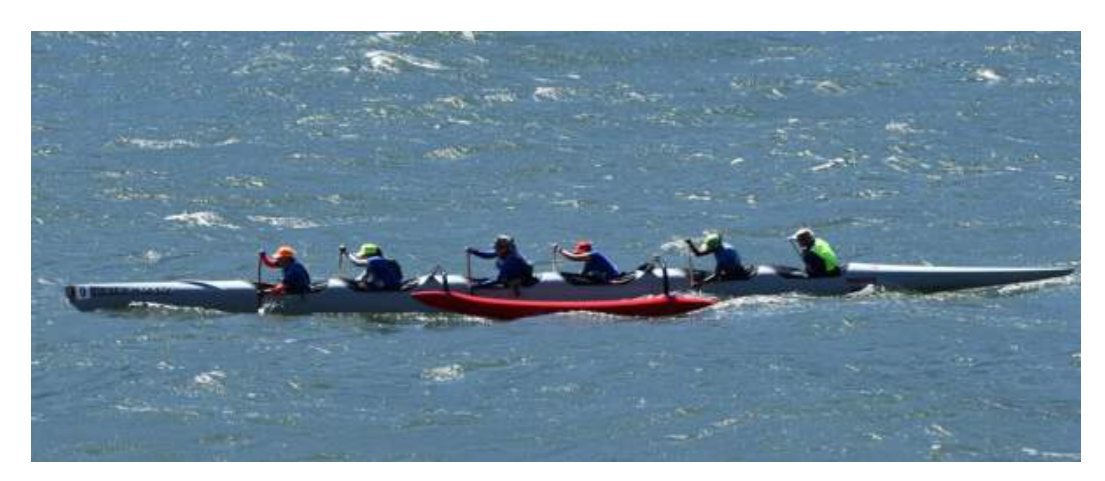
Senior Master Women!